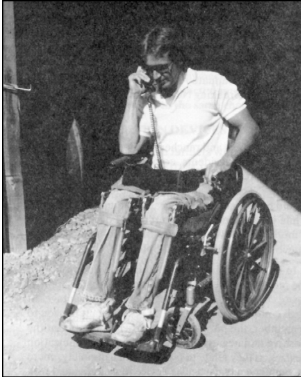
Figure 2. Cellular phones can be attached to a specific machine or can be mobile. If it's mobile, the individual can have it with them at all times.