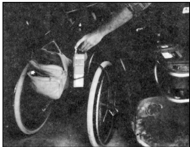
Figure 1. Good communication is a vital aspect of farming with a physical disability. Situations often require quick attention to keep the farmer safe and to speed farm operations.

A cellular phone ( Fig. 2 ) is similar to a regular phone with one major difference—it is linked to other phones by antennae rather than direct wiring. Signals are sent to and from the mobile unit allowing it to send and receive calls like an in-home phone.