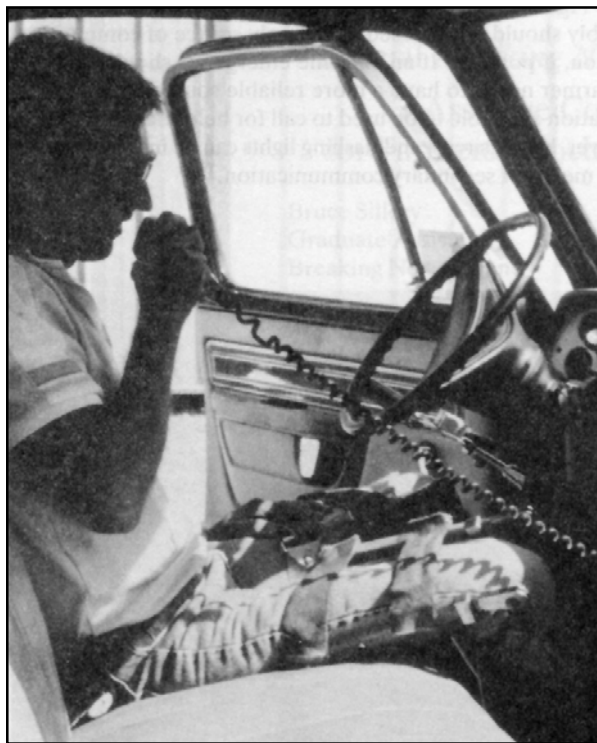
Figure 3. Using an FM radio allows easy access to others helping on the farm. By the press of a button, the individual is in contact with the person needed for assistance.

Prices for FM radios vary greatly depending on features, brand, and type of system. Portable units are normally more expensive and can range between $150 and $260. The antenna and hardware required to operate the FM radio base and mobile units will typically cost less than $50.